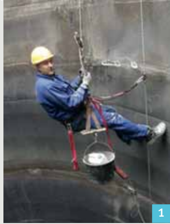
Repair of corroded steel areas

The use of FGD wet stacks helps to optimize the efficiency of coal fired units, but wet stack operation results in aggressive conditions for chimney flue linings.