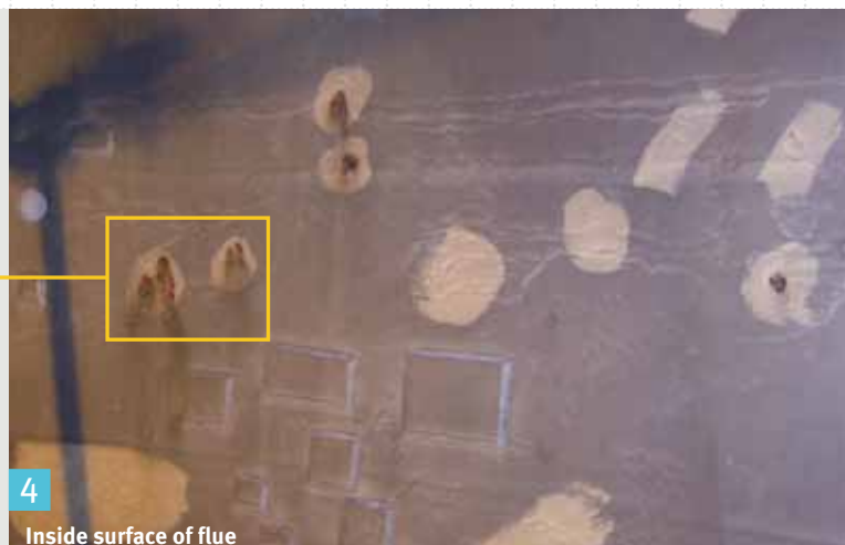
Inside surface of flue