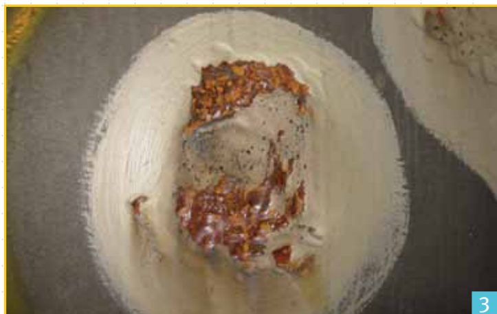
Corroded spots repaired with new coating, corroded again

Holes in the flue caused by acid dewpoint corrosion. The holes were repaired by welding new steel plates and protecting these with a new coating on the inside surface of the flue.