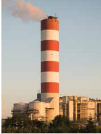
FGD wet stack with two steel flues