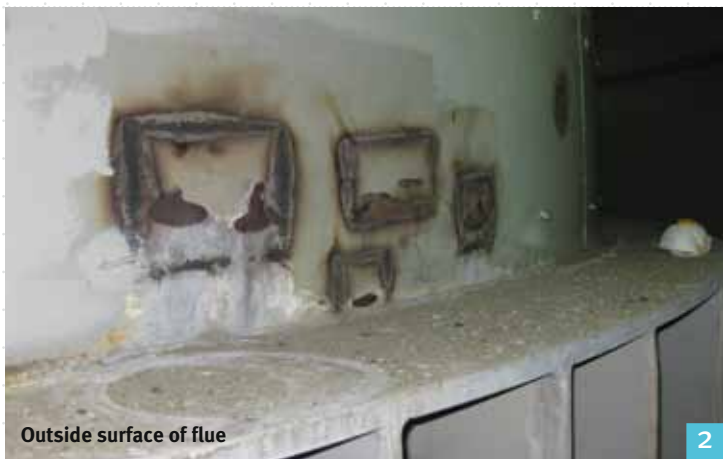
Outside surface of flue

Pictures 1-4 show the performance of the coated steel flues, before Pennguard® linings were installed.