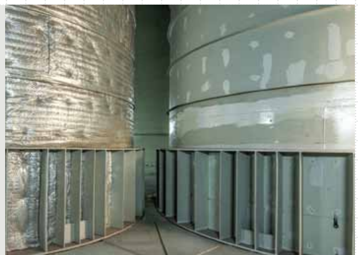
Figure 1. The flue on the left shows an irregular distribution of warmer and cooler spots, indicating significant thermal losses. The flue on the right has been internally Pennguard® lined.