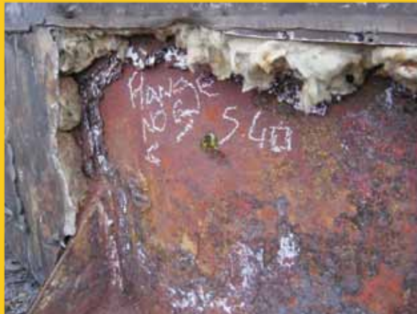
This photo shows an example of severe external corrosion to a steel chimney that had been externally insulated.

Pennguard®-lined steel chimneys avoid this risk, using only an external coating system to protect the structure against the elements. A modern, well applied coating can protect these chimneys over many years, possibly for the life of the chimney itself.