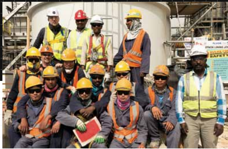
The lining installation team

On this work schedule, the Pennguard® lining installation in each chimney, including Hadek's final QA inspection, took 11 days to complete.