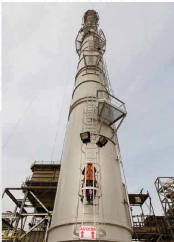
Pennguard® linings are strongly insulating, so no external insulation system is needed