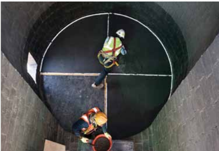
The floors of the chimneys have an additional protection of Tufchem® Silicate Concrete