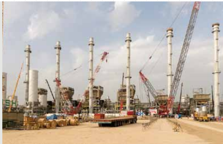
The six Pennguard®-lined steel chimneys