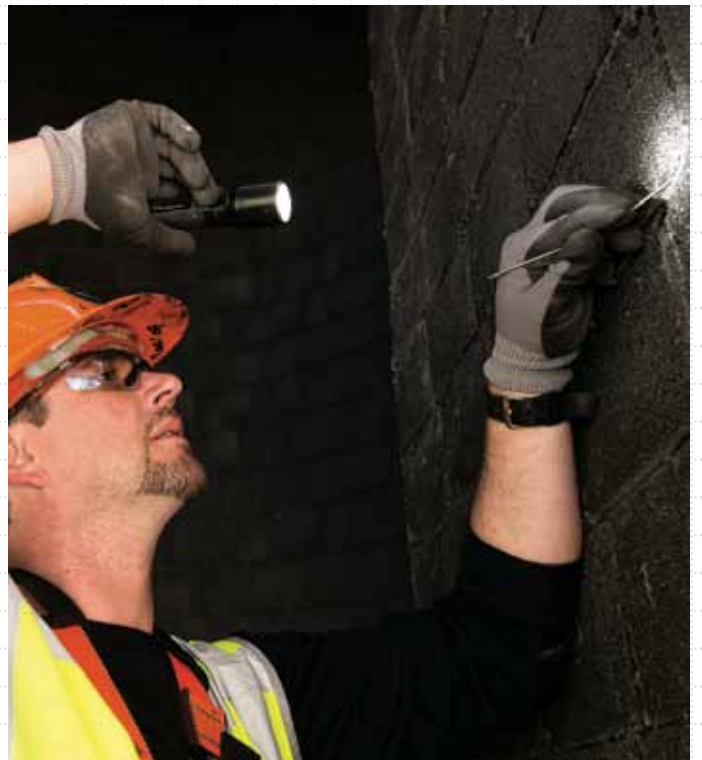
Hadek's QA Inspector examines the installed Pennguard® lining