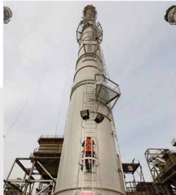
Pennguard® linings are strongly insulating, so no external insulation system is needed