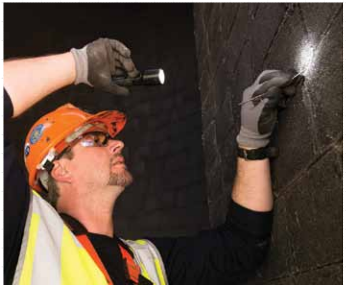
Hadek's QA Inspector examines the installed Pennguard® lining