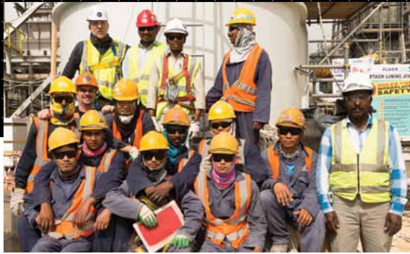
The lining installation team

On this work schedule, the Pennguard® lining installation in each chimney, including Hadek's final QA inspection, took 11 days to complete.