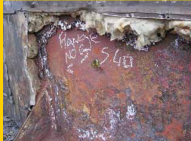
This photo shows an example of severe external corrosion to a steel chimney that had been externally insulated.

Pennguard®-lined steel chimneys avoid this risk, using only an external coating system to protect the structure against the elements. A modern, well applied coating can protect these chimneys over many years, possibly for the life of the chimney itself.