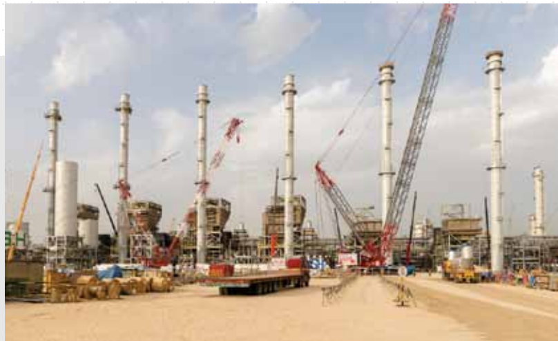
The six Pennguard®-lined steel chimneys