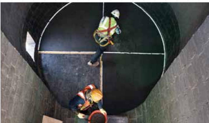
The floors of the chimneys have an additional protection of Tufchem® Silicate Concrete